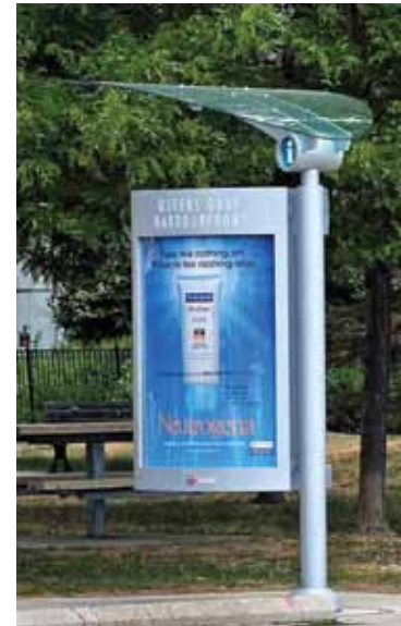
Toronto Street Column