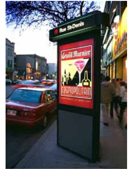
Montreal Street Column